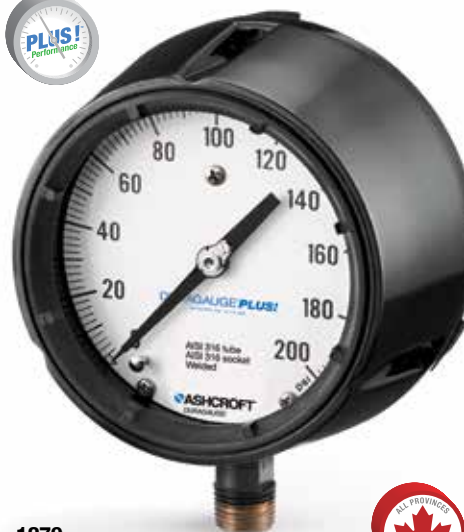
1279 4 1/2" dial size